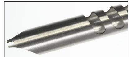
Large diameter biopsy device