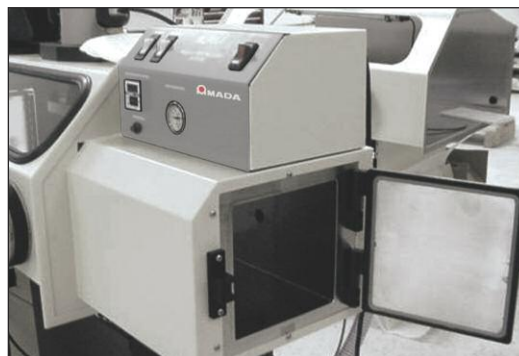
Alpha series optional vacuum bakeout oven