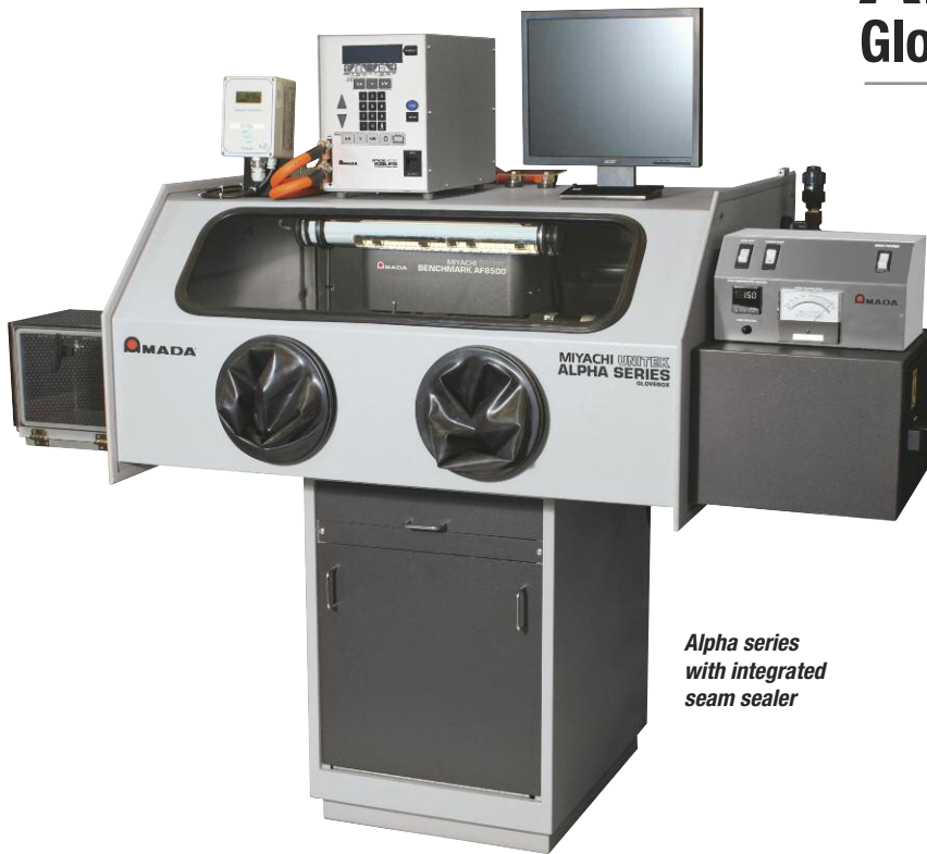
Alpha series with integrated seam sealer

The field proven Alpha Series glovebox systems provide compact and effective platforms for environmental control with excellent price to performance value. The Alpha Series is excellent for both production R&D applications. The glovebox is available in two sizes: one for projection welding applications and the other for seam sealing or general industrial use. Straight-forward controls allow the operator to easily operate oven, vacuum and inert gas backfill controls.