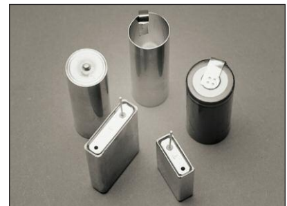
Marking parts of various heights