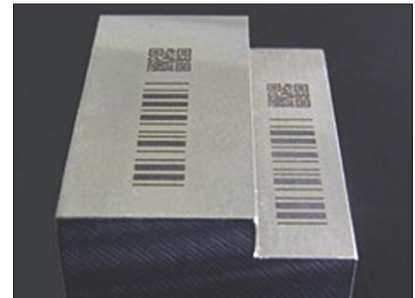
Marking two surfaces on the same part