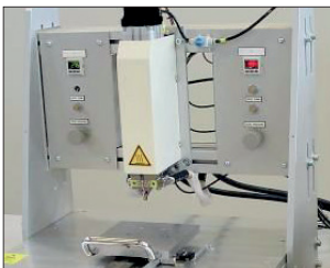
Pneumatic force control module

The motorized bonding heads are activated through a PLC controlled stepper-motor. Parameters including bonding force, search levels and travel speed can be programmed directly on the system PLC-controller. A force-fired control switch detects the correct bonding force and enables the bonding cycle.